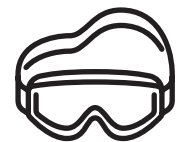
Protective eyewear (goggles, face shield, or safety glasses).