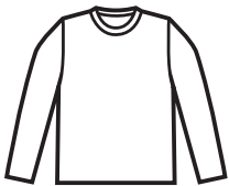
Long-sleeved shirt and pants

Applicators and other handlers who may be exposed to the dilute and / or concentrate through application