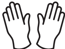
Chemical-resistant gloves made of Barrier Laminate, Nitrile Rubber > 14 mils