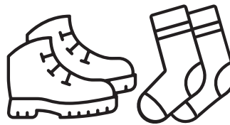
Shoes plus socks